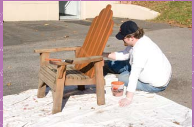
Volunteers from Citigroup help give the Social Rehabilitation Center's lawn furniture a new coat of varnish in November.