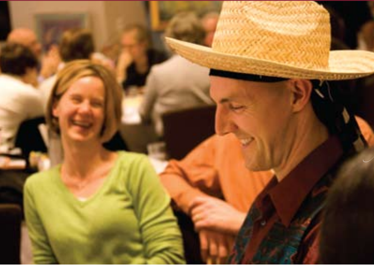
Guests at this year's Quizine for a Cause had a great time and raised $53,000 for Gilead.